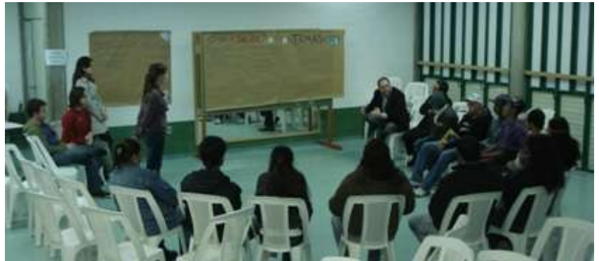
Photo: Students and Community

After one month, we started the practical activities with a meeting in the school of the Carreiros community with a Youth and Adult Education class. We decided to sit like a wheel and mix some students with community. We brought some brown paper and marker pens. We introduced ourselves and ask for them introduce themselves.