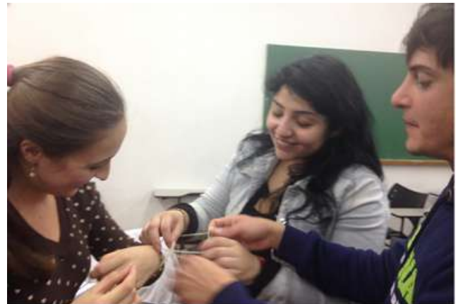
and medical relationship at the Health Education League Space.

Photo above: Image from a dynamic made by a junior student to explain health communication