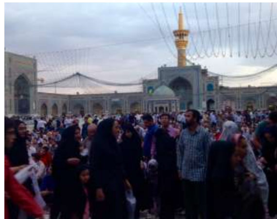
Photo: Inside the Imam Reza mosque complex in Mashhad

dominated by the Alborz Mountains, the city of Mashhad, built on an oasis on the former Silk Road and most famous for the tomb of Imam Reza, visited each year by millions of pilgrims, the former royal city of Isfahan, former capital of Persia, designated by UNESCO as a World Heritage Site for its outstanding examples of Iranian and Islamic architecture, including palaces and mosques and bridges, and a number of rural towns and villages.