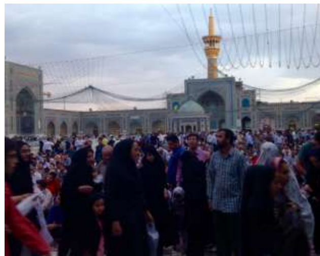
Foto: Interior de la mezquita de Imam Reza en Mashhad

la tumba del Imam Reza, visitada cada año por millones de peregrinos, la antigua ciudad de Isfahan, capital de Persia en el pasado, designada por la UNESCO como Patrimonio Mundial a causa de sus espectaculares ejemplos de arquitectura iraní e islámica con palacios, mezquitas y puentes y un buen número de poblaciones rurales a su alrededor.