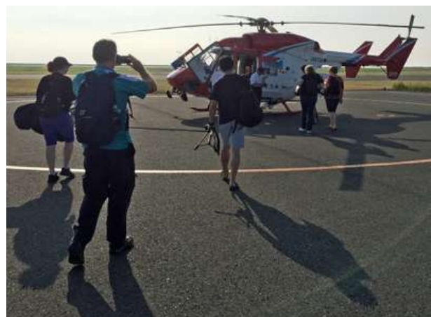
Photo: in Japan, the helicopter is used often