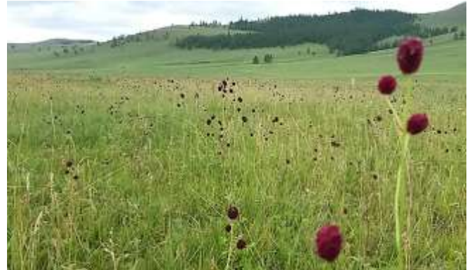
Photo: Medicinal Flowers used as infusion for stomachaches, Like eidelweiss for headaches, Mongolia

medicine abroad. South Korea and Turkey are the main countries where Mongol medical students go.