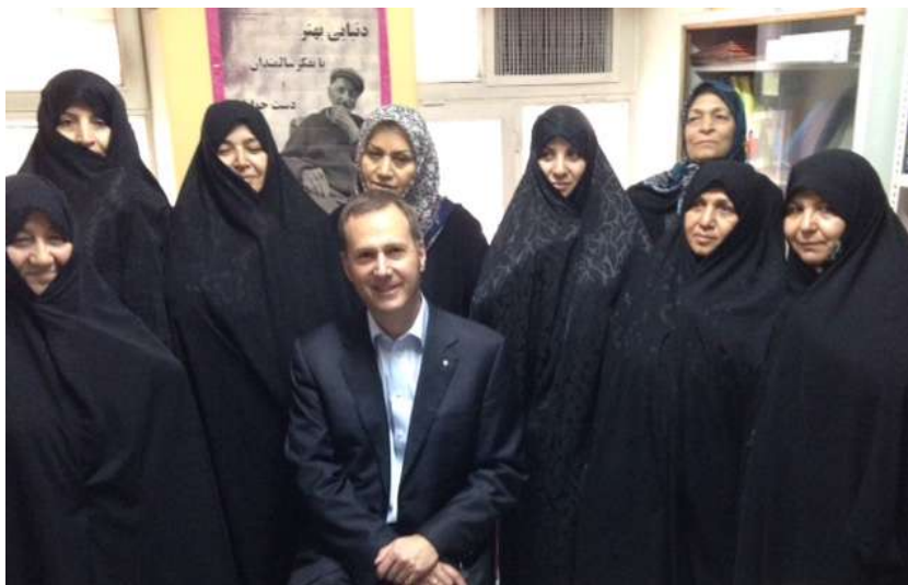
Foto: El presidente de WONCA con un grupo de voluntarios de asistencia en salud en el centro de Asistencia Primaria de Torab, en el centro de Teherán.