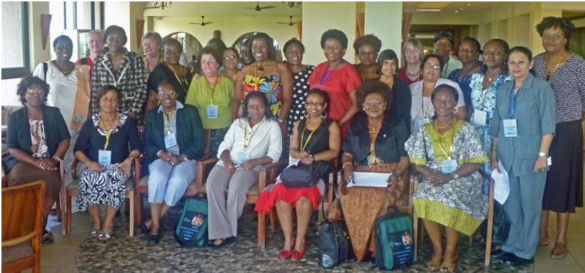
WONCA women get together at the conference