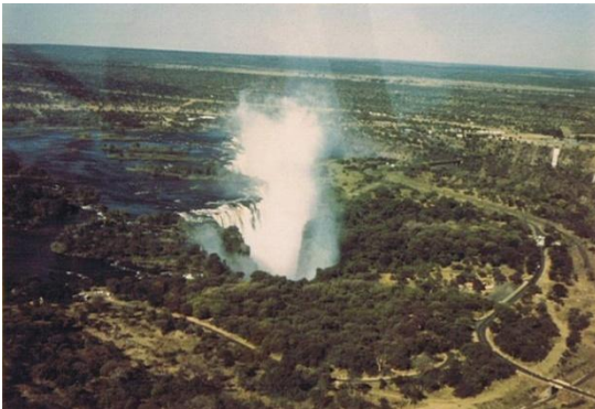
Victoria Falls - wet and dry season views

communal sharing and ingenious improvisation to offset limited resources all position Africa to be a dynamic and global leader in the future. I also believe that similar advances will happen in African health care. Limited resources force countries to focus on priorities and address important needs. In contrast, clinical service and research agendas in high income countries often lose creativity, flexibility, and relevance as they get tangled up in excessive bureaucracies, entrenched interests, and wasteful practices.