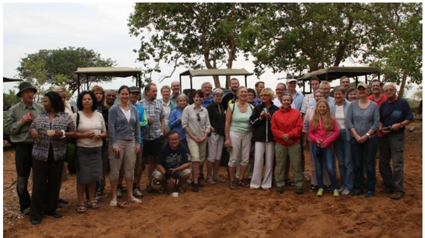
Scandinavian Delegation - on a game drive post-conference in Botswana