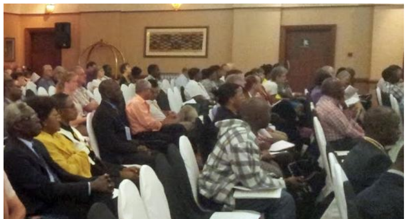
Session during the conference