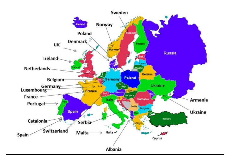
Figure 2: Country Profiles completed

Step 1: Country profiles were received and collated for 20 European countries (see figure 2). The collated data from these individual country reports is presented in Appendix 1 with summary detail provided below.