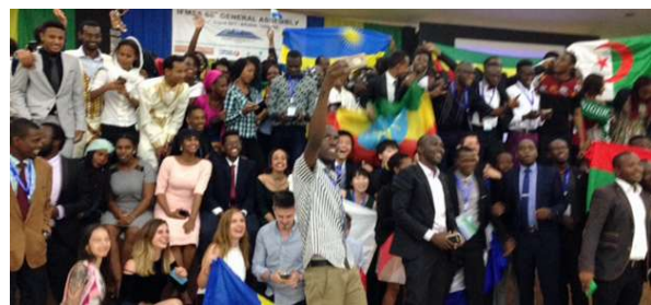
foto: Estudiantes de Medicina celebrando la ceremonia de apertura del encuentro IFMSA en Arusha, Tanzania.

Redes de trabajo, oportunidades y priorización – ¿es necesario encontrar un punto de equilibrio entre entusiasmo y realismo?