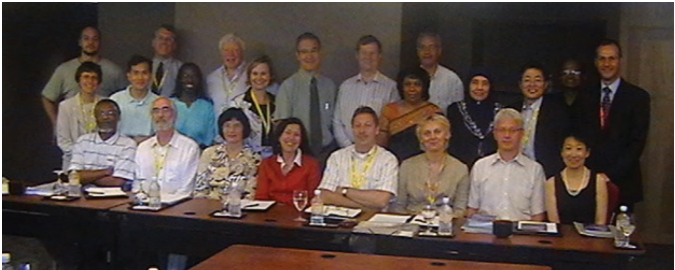
▲ Meeting of the newly established Wonca Working Party on Education