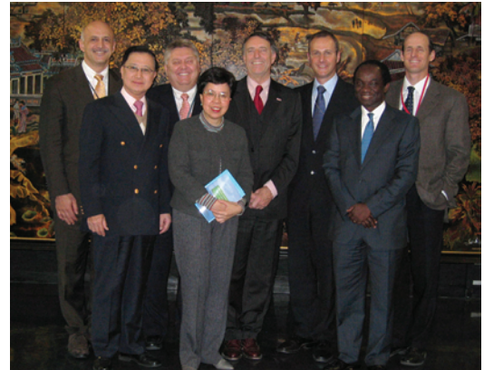
▲ Wonca Leadership at historic meeting with WHO Director General Margaret Chan