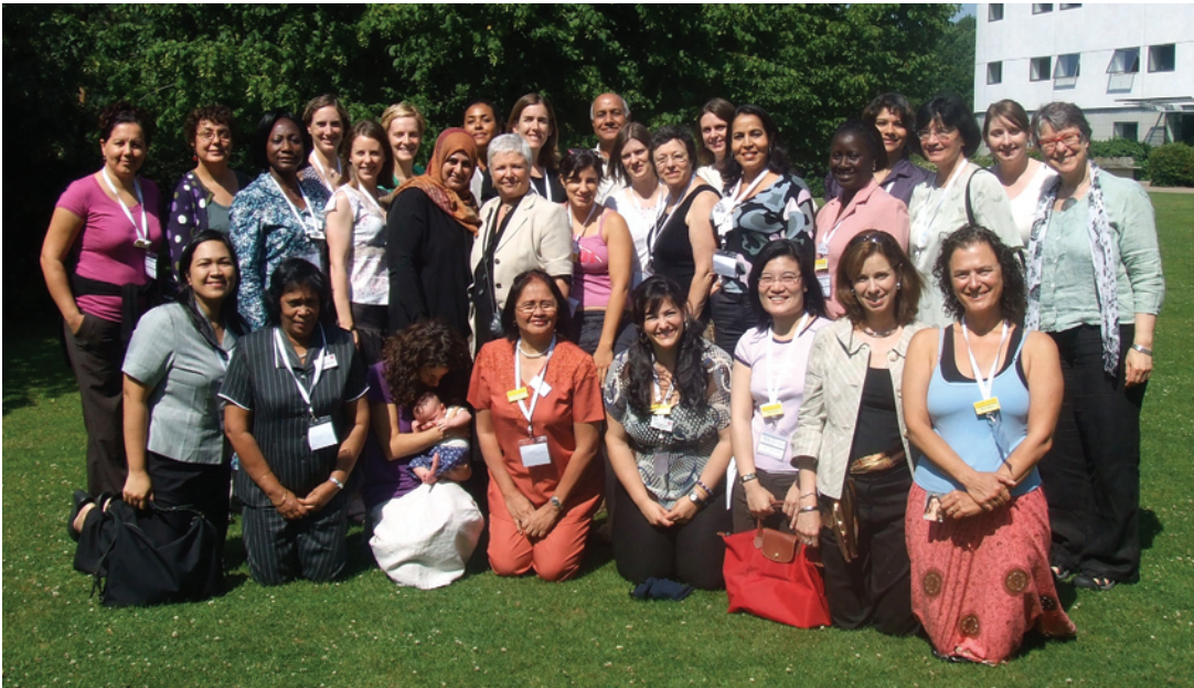
◀ Wonca Working Party on Women and Family Medicine at University of East Anglia, United Kingdom