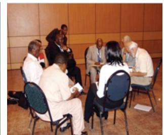
A Sub – Theme Workshop

This conference statement has now been published in the African Journal of Primary Health Care and Family Medicine, Vol. 2, No.1 (2010). This was an opportunity for Africa to define what Africa can relate to, rather than what is always derived from other countries, especially the developed world. This is the greatest achievement of the African Region so far and I am very happy to be associated with it.