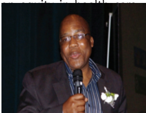
Honourable South African Minister of Health: Dr Aaron Motsoaledi

The conference was officially opened by the South African Minister of Health, Dr Aaron Motsoaledi. He spoke with passion about government commitment to primary health care and family medicine with a strong emphasis