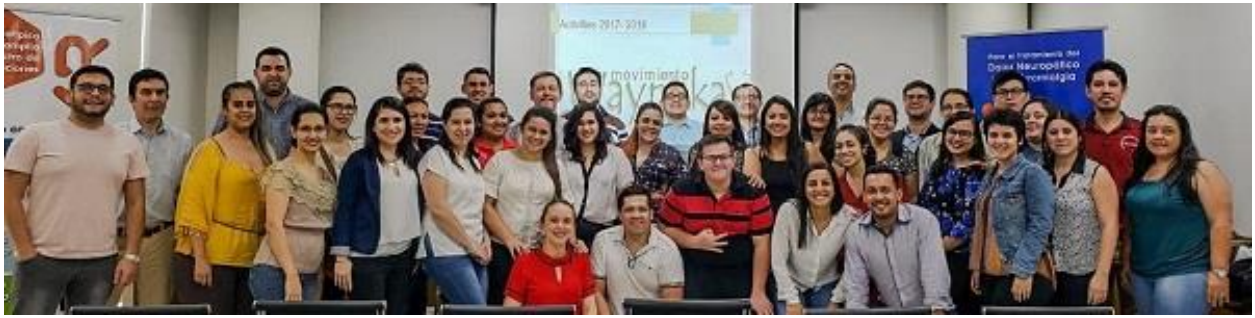
Photo: Paraguay YDM above.