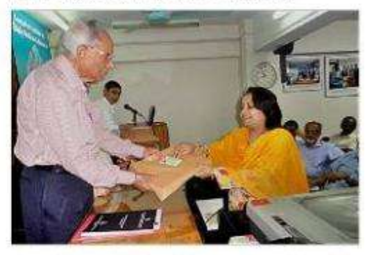
Course Classes Inauguration was held on 26 July 2013, Last Friday of the month of July at the BSU Auditorium, Eastern Plaza.

The FMD Course Session 2013-2014 of the Bangladesh Institute of Family Medicine & Research, the University of Science & Technology Chittagong was started on 1 July 2013 & will continue till 30 June 2014