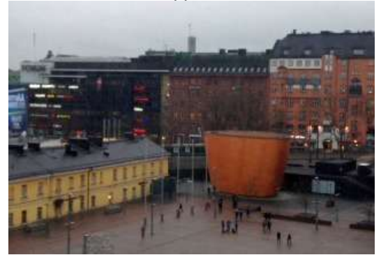
Photo: Downtown Helsinki with the remarkable wooden "Chapel of Quiet Contemplation"

population, including those living in the northern areas of Lappland.