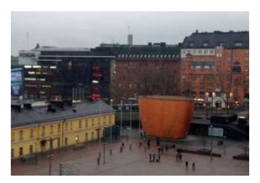
Foto: El centro de Helsinki con la madera extraordi naria de la "Capilla de la contempl

Y sólo 3.500 de los 20.000 médicos en Finlandia son médicos de familia. Esto supone una enorme presión sobre los servicios de atención primaria. Hasta un 30% de todos los médicos finlandeses trabajan en zonas rurales para garantizar el acceso equitativo a los servicios de salud para toda la población, incluidos los que viven en las zonas del norte de Laponia.