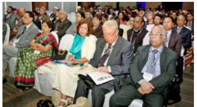
Participants from home and abroad at the WONCA South Asia Regional Conference 2015 in Dhaka.