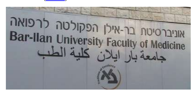
Photo: Bar Ilan University Faculty of Medicine sign, in English, Hebrew and Arabic.

and first in 34 years. The poor socioeconomic and health disparities of North Israel, and the need to enhance the physician workforce and health system to serve a diverse Arab and Jewish community contributed to this historic decision. (more)