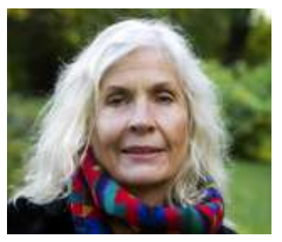
WONCA Europe Region President