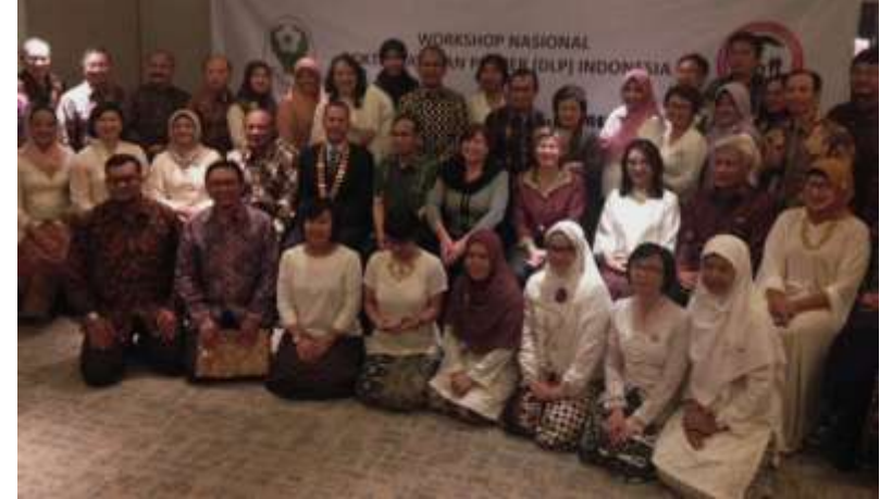
Photo: New fellows of the Indonesian College of Primary Care Physicians

This past month I have visited family medicine colleagues in Japan and Indonesia and have gained insights into some of the challenges facing family medicine development in each country.