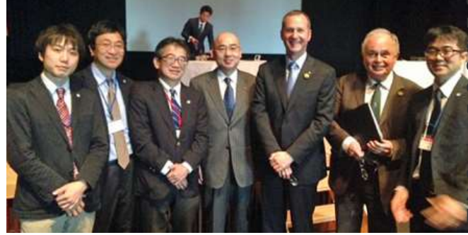
proporcionará un ejemplo asistencial para muchos otros países.

Japón será uno los primeros países en afrontar el impacto del envejecimiento de una parte sustancial de la población. En 2.025 la cantidad de población japonesa de 65 años o más será mayor que un tercio de la población total. La forma en que Japón afronta ese gran reto del envejecimiento de la población