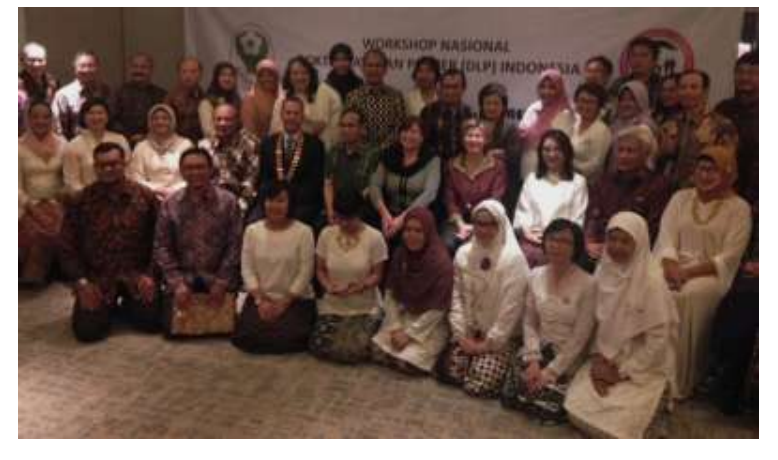
Foto: Nuevos compañeros de la Facultad de Medicina de Atención Primaria

El mes pasado visité a los colegas médicos de familia en Indonesia y en Japón y compartieron conmigo su percepción acerca de los retos para el desarrollo de la Medicina de Familia en cada país.