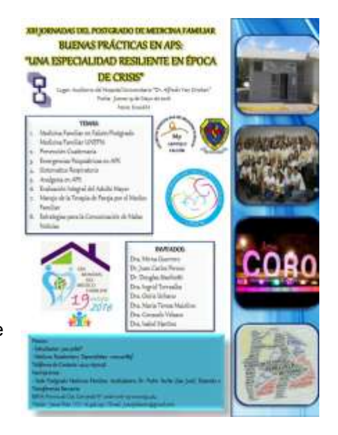
Photo 2 medicina familiar - una especialidad resiliente en epoca de crisis / family medicine - a resilient specialty in times of crisis

Photo 1 journada medicina familiar / Family Doctor Day