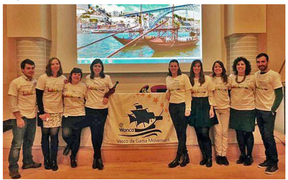
The Host Organising Committee of the 5th VdGM forum (there are two members missing).

On the 26-27th January, 2018, the 5th Vasco da Gama Movement (VdGM) Forum took place in the beautiful city of Porto, Portugal.