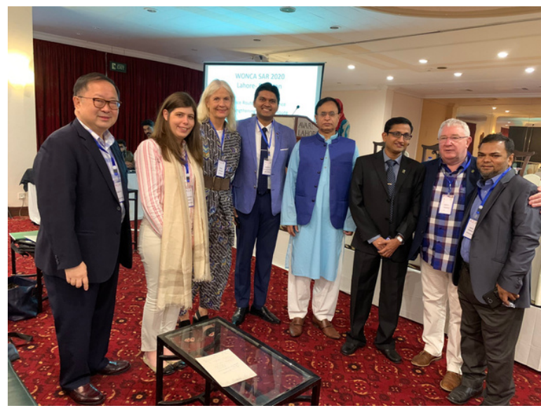
WONCA team supporting YDM in Lahore WONCA SAR 2020