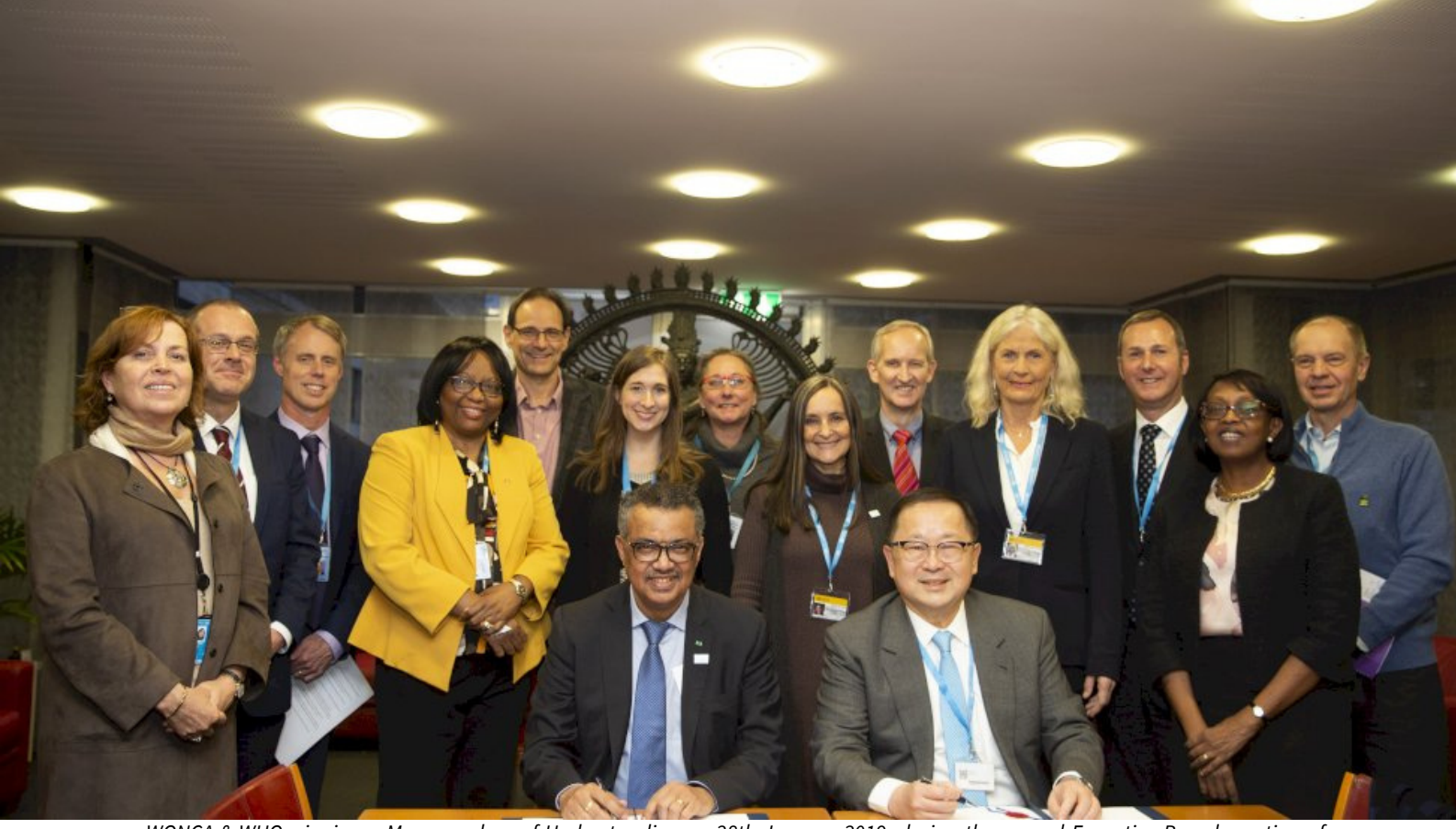
WONCA & WHO signing a Memorandum of Understanding on 28th January 2019, during the annual Executive Board meeting of WHO in Geneva.

We appreciate that being asked for comments and inputs by WHO reflects the growing recognition within WHO of the need for comprehensive, qualified and accessible primary care delivery, to achieve the global goal of Universal Health Coverage. In 2018 and 2019 I was involved in a number of high level WHO meetings. In October 2018, along with the immediate past President, President-Elect, our Young Doctor representative on Executive and two Members At Large, I attended the launch of the Astana Declaration in Kazakhstan. And in January 2019, after increasingly detailed work between us, I was delighted to sign an MOU on behalf of WONCA with WHO. From previous surveys, we know how important our relationship and influence with WHO is for our members. So, it was also very encouraging to be asked to present on behalf of WONCA at a side event at the World Health Assembly in May 2019. Our collaboration with WHO continues and we continue to exert our influence on policy and implementation, particularly in relation to primary care-led health