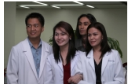
Philippine Family Medicine Resident Winners of the Clinico-Pathological Conference