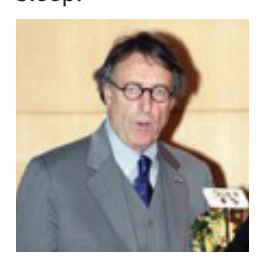
Wonca World President Chris van Weel

The Conference attendance was huge, with 4,700 participants attending from 73 countries. A wonderful, friendly and cheerful atmosphere facilitated a very enthusiastic and interactive scientific exchange at the Basel conference under the scientific program theme: The Fascination of Complexity' -Dealing with Individuals in a Field of Uncertainty". The conference provided a stimulating venue of 9 very well attended key note lectures, 130 hours of crowded workshops, 50 well frequented sessions with 6 oral presentations each, 555 posters, 2 poster awards and 2 empirical workshops. The venue even included mountain climbing within the exhibition hall to experience decision making in risk and stress situations as well as playing medical didgeridoo against snoring and sleep.