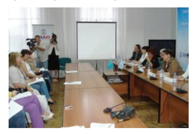
Press conference participants talked about the history of family medicine introduction in Kazakhstan that started in 1989 with the opening of the first mixed polyclinic for both children and adults. Since 1994, these efforts by the Ministry of Health were joined by the U.S. Agency for International Development (USAID), the Almaty Post-Graduate Institute for Physicians and – for the past 10 years - the Kazakhstan Association of Family Physicians.