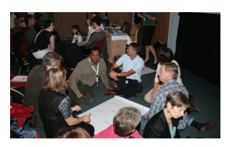
The Warm and Festive Basel Conference Atmosphere