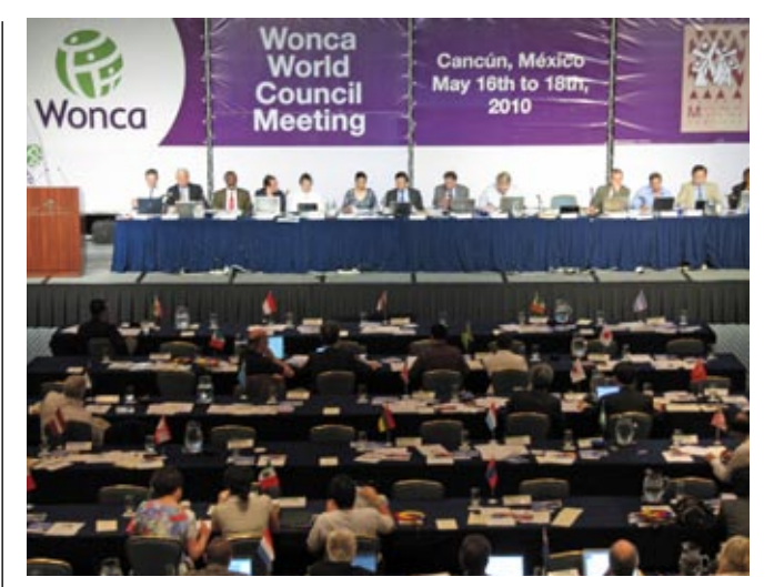
Wonca World Council meets in Cancun

Secondly, concerning Terms of Office - Council agreed that all elected members of the Executive be appointed for three year terms and may be reappointed for a second three year term. No elected member of the Executive should serve for more than two consecutive three year terms in any one office. Similarly, all Chairs of Committees of Council or Executive, and Chairs of Ad Hoc Task Forces, Working Parties, and Special Interest Groups should be appointed for three year terms. Chairs may be re-appointed for a second three year term, but no one should serve as Chair for more than two consecutive three year terms. Any appointed positions within the Executive, such as the Chief Executive Officer, have observer status and are not subject to terms of office.