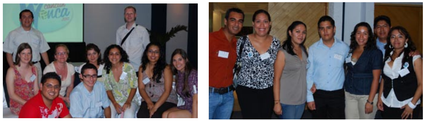
🔺 Young doctors at their Preconference in Cancún 🔺