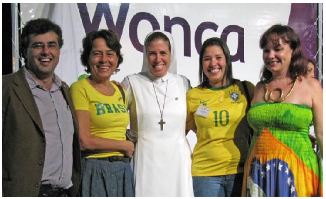
A jubilant team from Brazil after winning the bid to host the 2016 Wonca World Conference