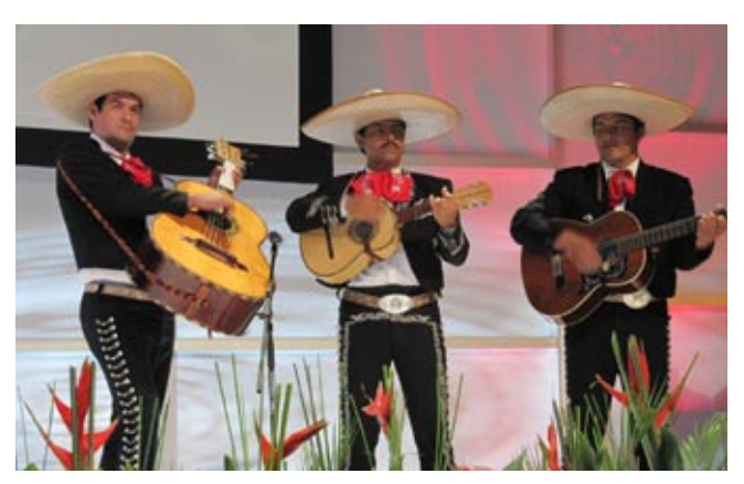
Mariachi musicians at the opening ceremony in Cancún 2010

At the Official Opening Ceremony, following a formal military procession to bring in the Mexican flag, conference registrants were treated to traditional Mexican folk dancing and of course a Mariachi band featuring a young man with a magnificent voice as singer.