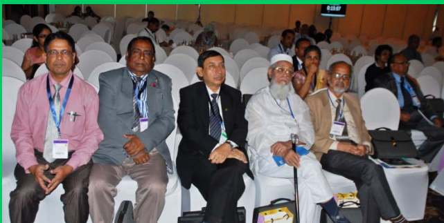
Participants of Academy at the scientific session

About 650 participants from host country, the Sub-continent and from the Whole World joined the programme. Members from the Academy delivered lectures at plenary session, free paper sessions, and chaired various sessions.