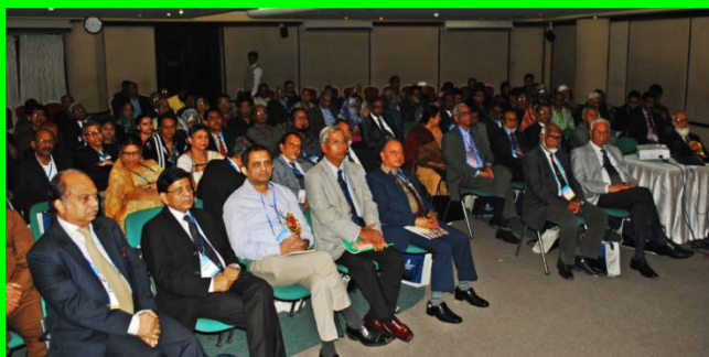
Participants at the Inauguration Ceremony

Inauguration of the Conference was held on 5 February 2016, Friday morning at the BRAC Centre Auditorium, 75 Mohakhali, Dhaka. Other programs of the day was also held at the same place including Scientific Sessions, MRCGP Workshop, Teas, Lunch, Dinner, Cultural Events, etc.