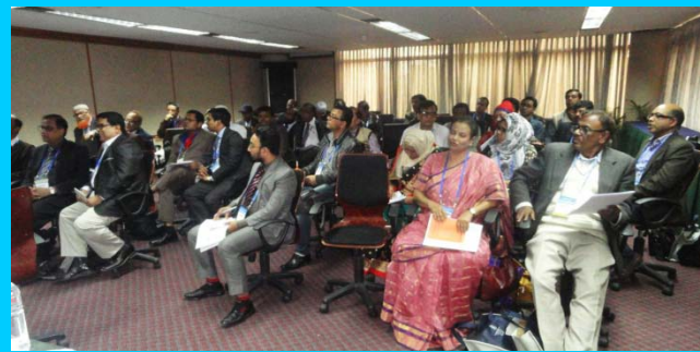
Participants at the MRCGP [Int.] Workshop

The session was on 5 February 2016 evening starting at 2.30 pm and continued till 7.00 pm. 50 participants were registered for the session.