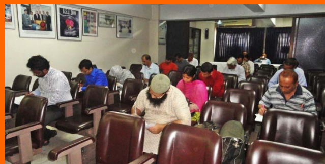
Family Medicine Diploma written examination

The Academy is associated with the management of the FMD course of the Bangladesh Institute of Family Medicine & Research of the university of Science & Technology Chittagong. Mid-term evaluation of the FMD course is going on.