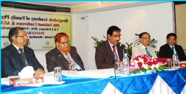
Scientific Session speakers, Chairs, & Rapporteur