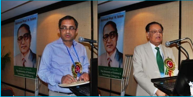
National Prof. N. Islam Memorial Lecture