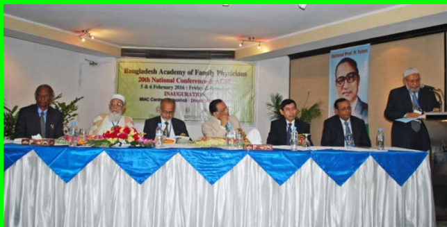
Inauguration of the 20 th National Conference

The Twentieth National Conference of the Bangladesh Academy of Family Physicians was held on 5 & 6 February 2016 at the BRAC Centre, 75 Mohakhali, Dhaka and 'Pond's Garden', Kanchon, Rupganj, Narayanganj.