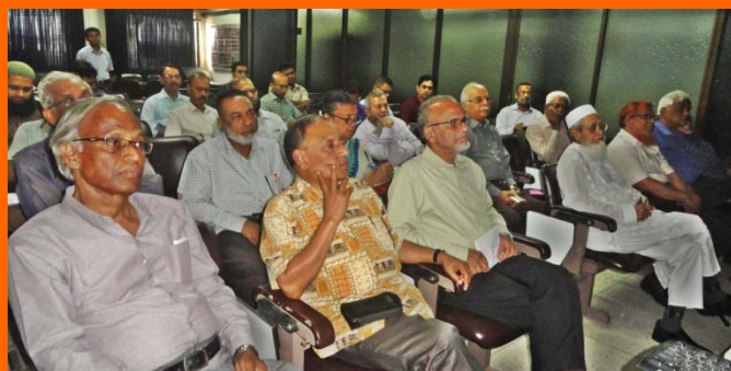
Participants at the Monthly CME