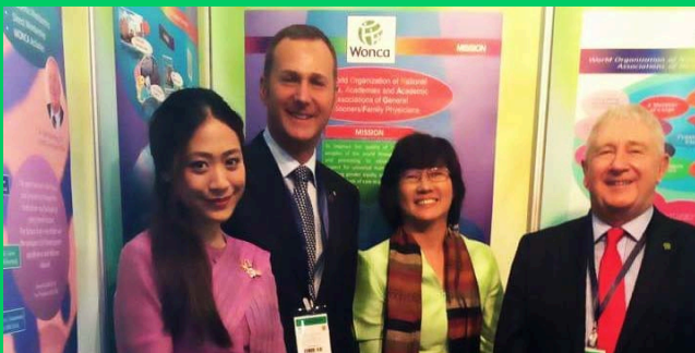
WONCA World Secretariat & WONCA President