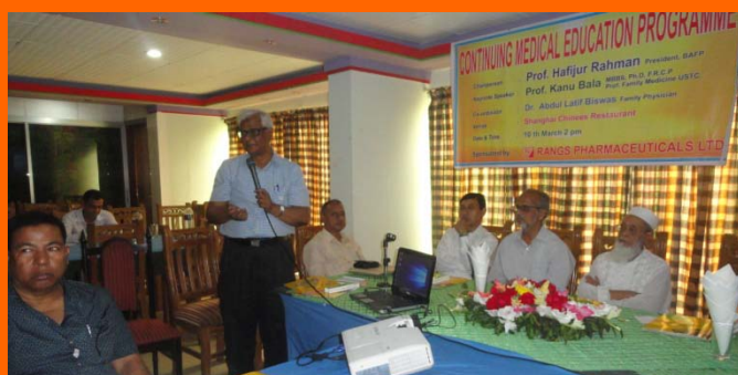
A CME at Savar, outside the Capital City Dhaka