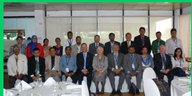
WONCA South Asia Committee Meeting