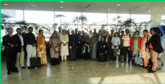
Delegate team arrived at the Colombo Airport

WONCA South Asia Regional Conference 2016 was held in Colombo, Sri Lanka on 11 to 14 February 2016. A Delegate Team consisting of 33 members from Bangladesh Academy of Family Physicians joined the conference. The 3 days programme started with an Inauguration Ceremony and Welcome Dinner.