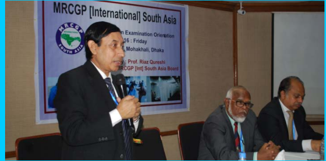
Introductory lecture at MRCGP [Int.] Workshop

A parallel session on the Orientation of MRCGP [International] South Asia was arranged at a small conference room with a capacity of 50 attendants.