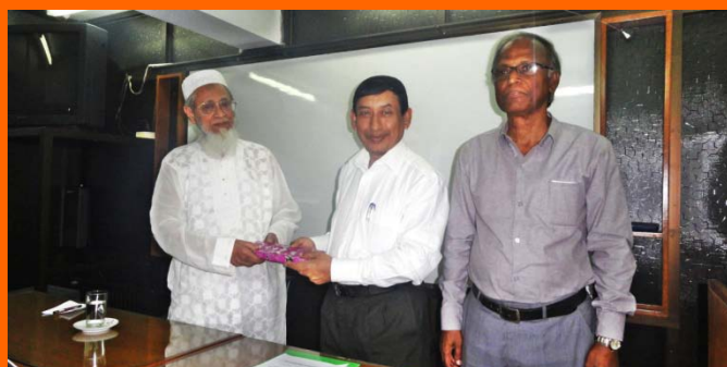
A token gift was given to the speaker of the CME

Bangladesh Academy of Family Physicians arranges Monthly Continuing Education Programme regularly on the Last Friday of every month. So far 234 programmes were organized. Occasionally the CME Programmes are organized outside Dhaka. Such a CME was organized at Savar on 10 March 2016.